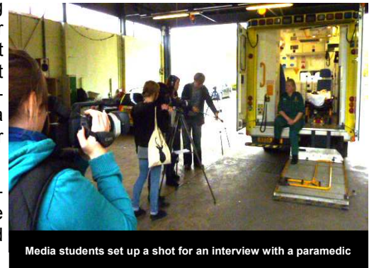
Media students set up a shot for an interview with a paramedic