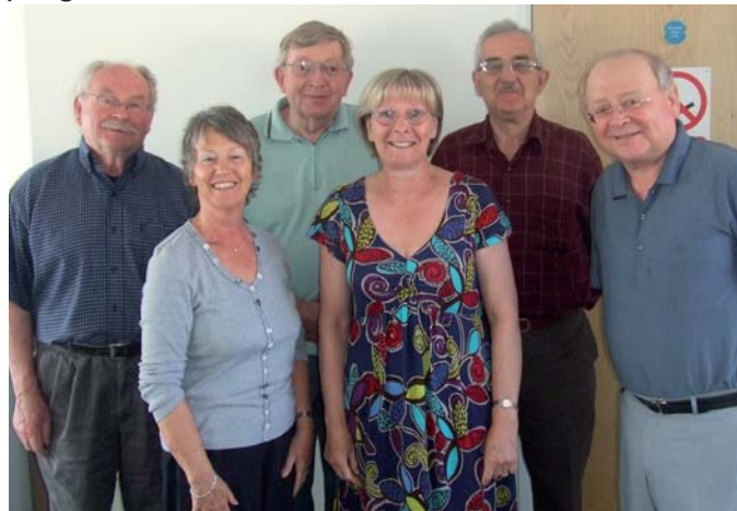
Dorset LINK Stewardship Group Members

It would be very difficult for eight people to be representative of the entire population of Dorset (all of whom can be involved in LINKs) so there is a Decision Making Process that takes into account the feedback from local