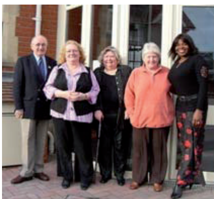
Picture: Some members of the Bournemouth LINK Stewardship Group

Tel: 0300 111 0102 Email: contact@makesachange.org.uk Website: www.makesachange.org.uk Freepost Licence No. BH1902 LINKs, The Pokesdown Centre, 896 Christchurch Road, Bournemouth, BH7 6BR