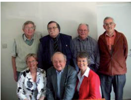
Picture: Some members of the Dorset Stewardship Group

We are also undertaking community engagement work across the county ensuring people and groups are made aware of the LINK and have an opportunity to get involved. The Dorset Stewardship Group has also decided and agreed to continue their roles within the group for a further six months.